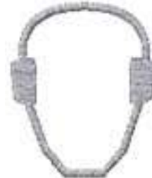
AEMU 0209 / 900 Sts