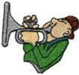
AEMU 0201 / 4700 Sts