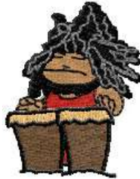
AEMU 0208 / 6100 Sts