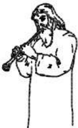
AEMU 0216 / 1500 Sts