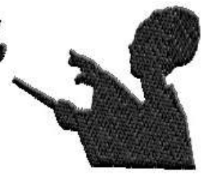
AEMU 0220 / 2700 Sts