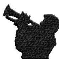
AEMU 0224 / 3900 Sts