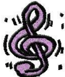
AEMU 0223 / 4400 Sts