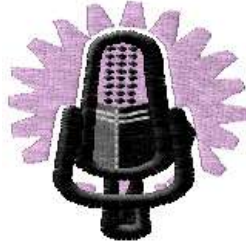
AEMU 0212 / 4900 Sts