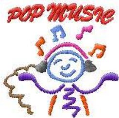
AEMU 0211 / 3300 Sts