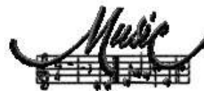
AEMU 0214 / 1800 Sts