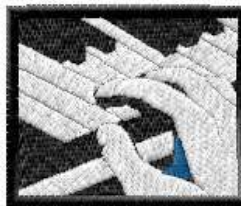
AEMU 0218 / 9600 Sts