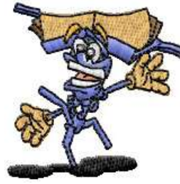
AEMU 0204 / 6000 Sts