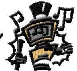
AEMU 0215 / 5100 Sts