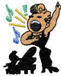
AEMU 0217 / 4600 Sts