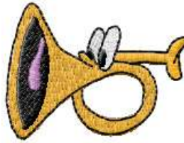
AEMU 0203 / 3500 Sts