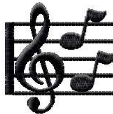
AEMU 0213 / 3600 Sts