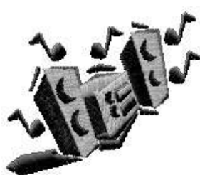
AEMU 0222 / 3800 Sts