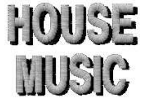
AEMU 0210 / 5800 Sts