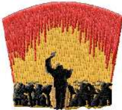
AEMU 0206 / 8600 Sts