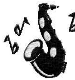
AEMU 0219 / 3500 Sts