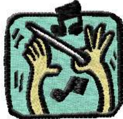
AEMU 0207 / 9600 Sts