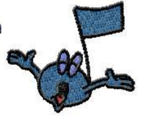
AEMU 0205 / 3900 Sts