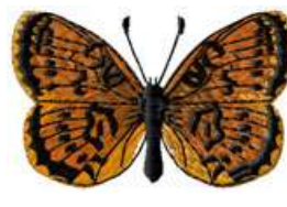
ANBU 0119 / 6700 Sts

1: 1 Brown 2: 2 Blue 3: 3 Light Yellow 4: 4 Black 5: 5 Cream/White 6: 1 Brown