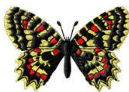
ANBU 0123 / 6800 Sts

1: 1 Cream 2: 2 Dark Cream 3: 3 Red 4: 4 Black 5: 1 Cream