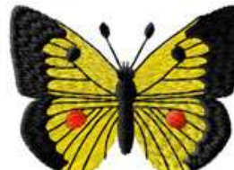
ANBU 0124 / 5200 Sts

1: 1 Yellow 2: 2 Red 3: 3 Black 4: 1 Yellow