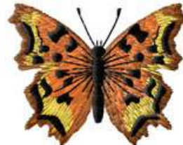
ANBU 0114 / 6200 Sts

1: 1 Black 2: 2 Light Yellow 3: 3 Pale Blue 4: 4 Red 5: 5 Dusty Brown 6: 1 Black