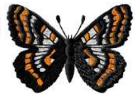
ANBU 0120 / 5900 Sts

1: 1 Orange 2: 2 Yellow 3: 3 Brown 4: 4 Black 5: 1 Orange