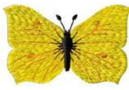
ANBU 0117 / 4300 Sts

1: 1 Cream 2: 2 White 3: 3 Light Brown 4: 4 Brown 5: 5 Black 6: 1 Cream