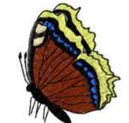
ANBU 0118 / 5300 Sts

1: 1 Yellow 2: 2 Orange 3: 3 Brown 4: 4 Black 5: 1 Yellow