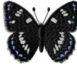
ANBU 0109 / 7600 Sts

1: 1 Purple 2: 2 Orange 3: 3 Brown 4: 4 White 5: 5 Black 6: 1 Purple