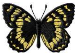
ANBU 0121 / 6100 Sts

1: 1 White 2: 2 Orange 3: 3 Black 4: 1 White