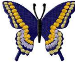
ANBU 0103 / 5100 Sts

1: 1 Inner Wing 2: 2 Outer Wing 3: 3 Black 4: 1 Inner Wing