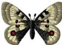
ANBU 0122 / 5800 Sts

1: 1 Cream 2: 2 Dark Cream 3: 3 Red 4: 4 Black 5: 1 Cream