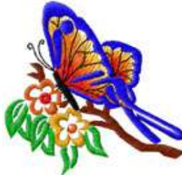
ANBU 0107 / 4700 Sts

1: 1 Pale Purple 2: 2 Pale Blue 3: 3 Silver/Grey 4: 4 White 5: 1 Pale Purple