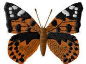
ANBU 0115 / 5800 Sts

1: 1 Wings 2: 2 Light Brown 3: 3 Orange 4: 4 Yellow 5: 5 Black 6: 1 Wings