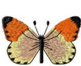
ANBU 0111 / 4600 Sts

1: 1 Orange 2: 2 White 3: 3 Blue 4: 4 Black 5: 1 Orange