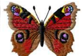
ANBU 0125 / 6200 Sts

1: 1 Yellow 2: 2 Black 3: 3 Red 4: 1 Yellow