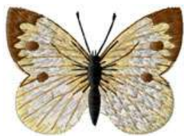
ANBU 0116 / 5500 Sts

1: 1 Orange 2: 2 Black 3: 3 Brown 4: 4 White 5: 1 Orange