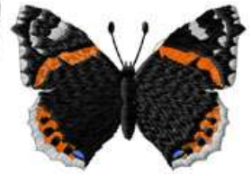
ANBU 0110 / 5600 Sts

1: 1 Pale Blue 2: 2 White 3: 3 Grey 4: 4 Black 5: 1 Pale Blue