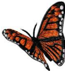
ANBU 0112 / 6100 Sts

1: 1 Cream 2: 2 Beige 3: 3 Orange 4: 4 Black 5: 1 Cream