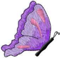
ANBU 0101 / 5100 Sts

1: 1 Lilac 2: 2 Purple 3: 1 Lilac 4: 3 Light Purple 5: 4 Black 6: 5 Pink 7: 1 Lilac