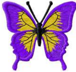
ANBU 0102 / 6000 Sts

1: 1 Lilac 2: 2 Purple 3: 1 Lilac 4: 3 Light Purple 5: 4 Black 6: 5 Pink 7: 1 Lilac