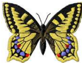
ANBU 0113 / 6800 Sts

1: 1 Orange 2: 2 Brown 3: 3 Black 4: 1 Orange 5: 2 Brown 6: 4 White 7: 1 Orange