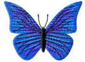
ANBU 0105 / 4900 Sts

1: 1 Inner Wing 2: 2 Outer Wing 3: 3 Black 4: 1 Inner Wing