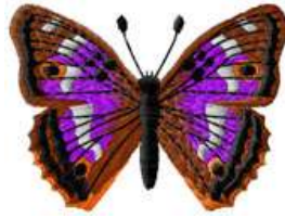
ANBU 0108 / 8000 Sts

1: 1 Brown 2: 2 Yellow 3: 3 Orange 4: 4 Red 5: 5 Blue 6: 6 Black 7: 7 Green 8: 1 Brown