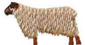
ANFA 0225 / 3000 Sts