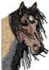
ANFA 0211 / 6800 Sts