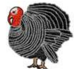
ANFA 0224 / 11200 Sts