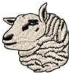
ANFA 0222 / 6500 Sts