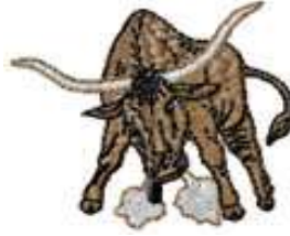
ANFA 0203 / 4800 Sts