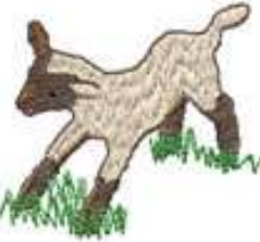
ANFA 0213 / 4200 Sts