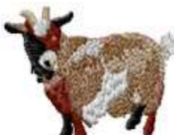
ANFA 0218 / 5000 Sts