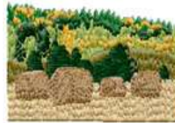
ANFA 0209 / 7600 Sts