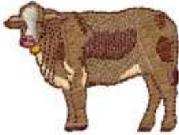
ANFA 0206 / 4900 Sts