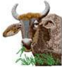
ANFA 0202 / 6200 Sts