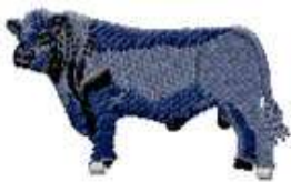
ANFA 0201 / 3600 Sts