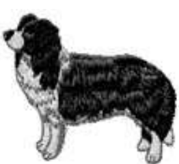
ANFA 0221 / 4600 Sts