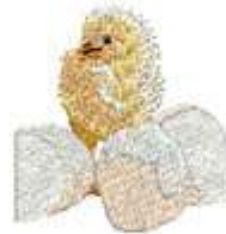
ANFA 0204 / 5100 Sts