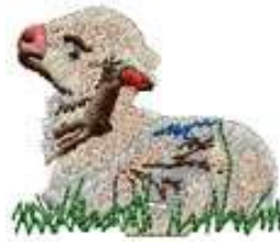
ANFA 0212 / 6500 Sts