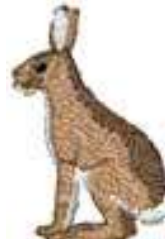
ANFA 0208 / 3900 Sts