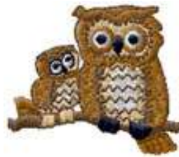
ANFA 0214 / 7500 Sts