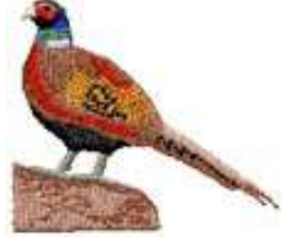
ANFA 0215 / 4500 Sts