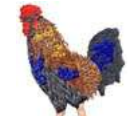
ANFA 0219 / 5100 Sts