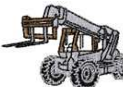
ANFA 0223 / 5300 Sts