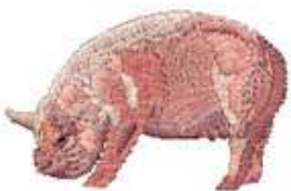
ANFA 0216 / 5100 Sts