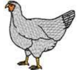
ANFA 0205 / 6500 Sts