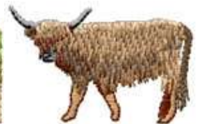
ANFA 0210 / 3400 Sts