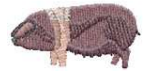
ANFA 0220 / 3100 Sts