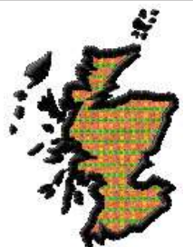
CRSC 0225 / 4700 Sts 1: 1 Red 4: 4 Black 2: 2 Yellow 5: 1 Red 3: 3 Green

First number is the Design Reference Number. 2nd number is the amount of stitches in the design