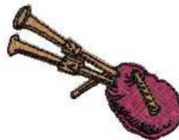
CRSC 0218 / 3000 Sts 1: 1 Burgundy 3: 3 Black 2: 2 Brown 4: 1 Burgundy