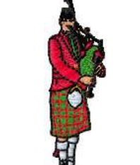
CRSC 0217 / 4900 Sts 1: 1 Flesh 5: 3 Green 8: 2 White 11: 1 Flesh 2: 2 White 6: 5 Gold 9: 5 Gold 12: 6 Black 3: 3 Green 7: 4 Red 10: 6 Black 13: 1 Flesh 4: 4 Red