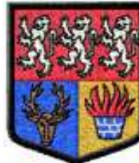
ROSS-SHIRE CRSC 0209 / 13300 Sts 1: 1 Gold 4: 4 Border 7: 6 Brown 2: 2 Blue 5: 2 Blue 8: 7 Black 3: 3 Red 6: 5 White 9: 1 Gold