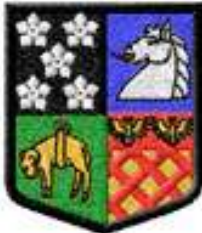
PEEBLES SHIRE CRSC 0206 / 11900 Sts 1: 1 Gold 5: 5 Black 9: 5 Black 2: 2 Blue 6: 6 Border 10: 1 Gold 3: 3 Red 7: 7 White 4: 4 Green 8: 1 Gold