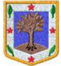
WEST LOTHIAN CRSC 0215 / 10300 Sts 1: 1 Blue 5: 5 Border 2: 2 Brown 6: 6 Red 3: 3 Black 7: 7 Green 4: 4 White 8: 1 Blue