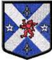
STIRLINGSHIRE CRSC 0213 / 10000 Sts 1: 1 White 4: 4 Grey 7: 5 Red 2: 2 Blue 5: 1 White 8: 6 Black 3: 3 Border 6: 2 Blue 9: 1 White