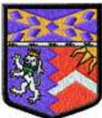
WIGTOWNSHIRE CRSC 0216 / 11500 Sts 1: 1 White 5: 1 White 8: 2 Red 11: 7 Green 2: 2 Red 6: 5 Black 9: 1 White 12: 5 Black 3: 3 Gold 7: 6 Border 10: 3 Gold 13: 1 White 4: 4 Blue