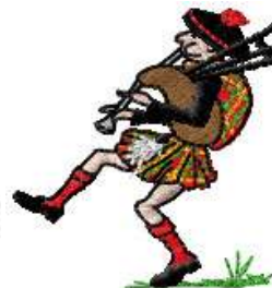
CRSC 0219 / 4200 Sts 1: 1 Red 5: 5 Grey 9: 8 White 2: 2 Green 6: 6 Flesh 10: 7 Black 3: 3 Yellow 7: 7 Black 11: 1 Red 4: 4 Brown 8: 1 Red