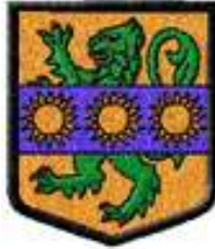
MIDLOTHIAN CRSC 0202 / 12600 Sts 1: 1 Gold 4: 4 Blue 7: 1 Gold 2: 2 Red 5: 5 Border 8: 7 Black 3: 3 Green 6: 6 White 9: 1 Gold