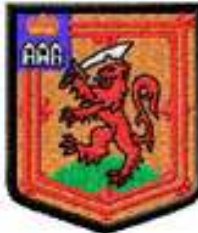
PERTHSHIRE CRSC 0207 / 12500 Sts 1: 1 Gold 5: 5 Red 9: 5 Red 2: 2 Blue 6: 6 White 10: 1 Gold 3: 3 Border 7: 7 Brown 11: 8 Black 4: 4 Green 8: 2 Blue 12: 1 Gold