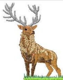
CRSC 0223 / 6800 Sts 1: 1 Tan 5: 5 Beige 8: 7 Grey 11: 8 D.Green 2: 2 D.Brown 6: 6 Black 9: 3 L.Brown 12: 9 L.Green 3: 3 L.Brown 7: 3 L.Brown 10: 6 Black 13: 1 Tan 4: 4 M.Brown