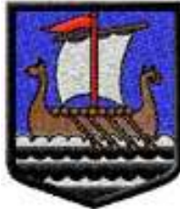
SHETLAND CRSC 0212 / 11000 Sts 1: 1 Blue 5: 2 White 9: 5 Black 2: 2 White 6: 5 Black 10: 1 Blue 3: 3 Red 7: 6 Border 4: 4 Brown 8: 4 Brown