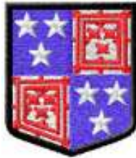
MORAYSHIRE CRSC 0203 / 10200 Sts 1: 1 White 4: 4 Red 2: 2 Blue 5: 1 White 3: 3 Border