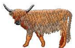
CRSC 0220 / 3400 Sts 1: 1 Tan 5: 4 M.Brown 9: 4 M.Brown 13: 7 Black 2: 2 D.Brown 6: 1 Tan 10: 2 D.Brown 14: 1 Tan 3: 3 L.Brown 7: 5 L.Tan 11: 1 Tan 4: 2 D.Brown 8: 6 Grey 12: 5 L.Tan