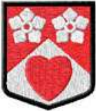
LANARKSHIRE CRSC 0201 / 8800 Sts 1: 1 White 3: 3 Border 2: 2 Red 4: 1 White