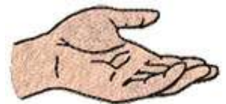
HMHA 0115 / 3300 Sts