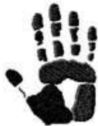
HMHA 0111 / 2300 Sts

1: 1 Red 2: 2 Flesh 3: 3 White 4: 4 Black 5: 1 Red