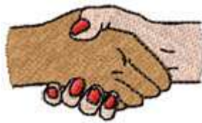
HMHA 0112 / 3700 Sts

1: 1 Peach 2: 2 Brown 3: 1 Peach 4: 3 Red 5: 4 Black 6: 1 Peach