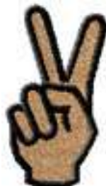
HMHA 0117 / 3600 Sts