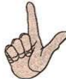
HMHA 0104 / 3400 Sts