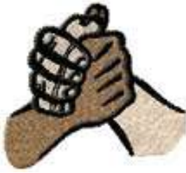
HMHA 0101 / 5500 Sts

1: 1 Peach 2: 2 Brown 3: 3 Black 4: 1 Peach