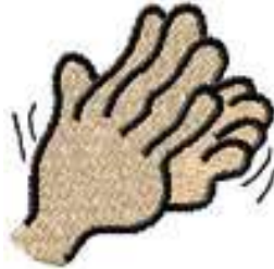
HMHA 0102 / 4500 Sts

1: 1 Peach 2: 2 Brown 3: 3 Black 4: 1 Peach