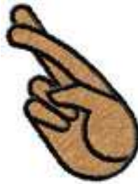
HMHA 0108 / 3800 Sts