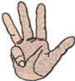
HMHA 0106 / 4100 Sts