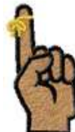
HMHA 0124 / 3400 Sts

1: 1 Flesh 2: 2 Light Blue 3: 3 Dark Blue 4: 4 Black 5: 1 Flesh