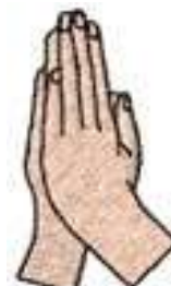
HMHA 0119 / 3100 Sts