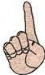
HMHA 0103 / 3100 Sts