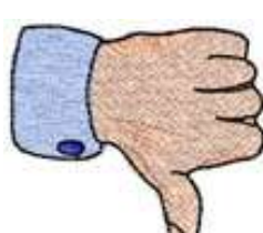
HMHA 0122 / 4200 Sts

1: 1 Black 2: 2 Flesh 3: 3 Off White 4: 4 Blue 5: 5 Brown 6: 1 Black