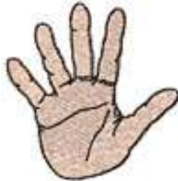
HMHA 0107 / 3900 Sts