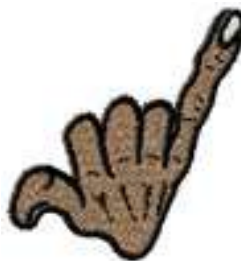
HMHA 0113 / 3900 Sts

1: 1 Peach 2: 2 Brown 3: 1 Peach 4: 3 Red 5: 4 Black 6: 1 Peach