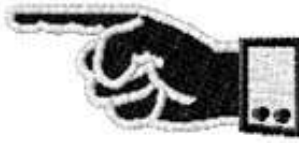
HMHA 0118 / 2900 Sts