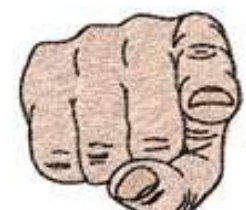
HMHA 0125 / 5400 Sts

1: 1 Flesh 2: 2 Black 3: 3 Yellow 4: 1 Flesh