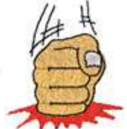
HMHA 0110 / 3600 Sts

1: 1 Red 2: 2 Flesh 3: 3 White 4: 4 Black 5: 1 Red