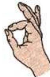
HMHA 0114 / 3100 Sts

1: 1 Flesh 2: 2 Brown 3: 3 Black 4: 1 Flesh