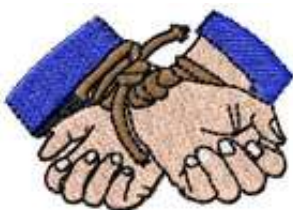
HMHA 0121 / 6100 Sts

1: 1 Black 2: 2 Flesh 3: 3 Off White 4: 4 Blue 5: 5 Brown 6: 1 Black