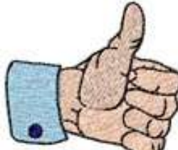
HMHA 0123 / 3900 Sts

1: 1 Flesh 2: 2 Dark Flesh 3: 3 Light Blue 4: 4 Blue 5: 5 Black 6: 1 Flesh