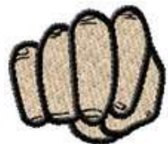
HMHA 0120 / 4500 Sts