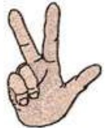
HMHA 0105 / 3400 Sts